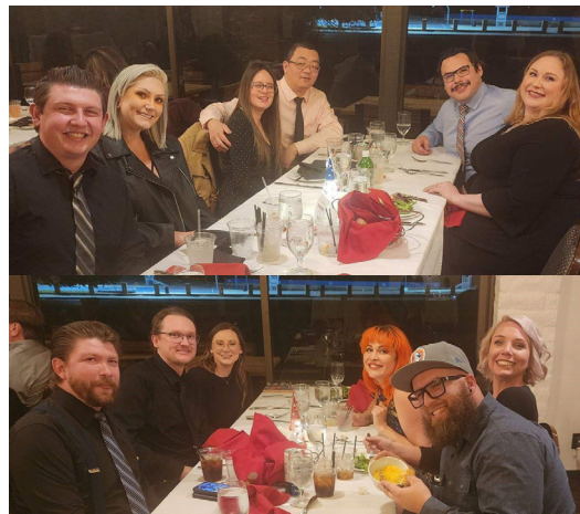
VWRA staff enjoying the party with their spouses.