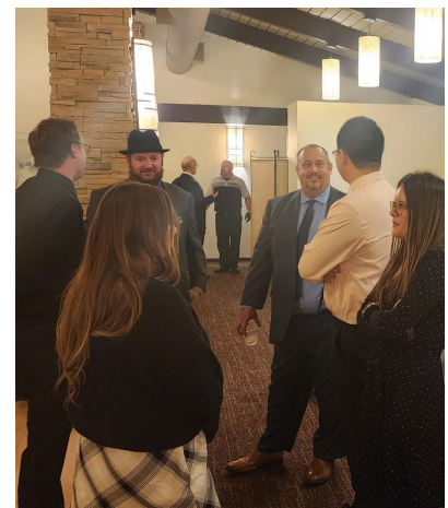
VWRA staff at awards banquet.