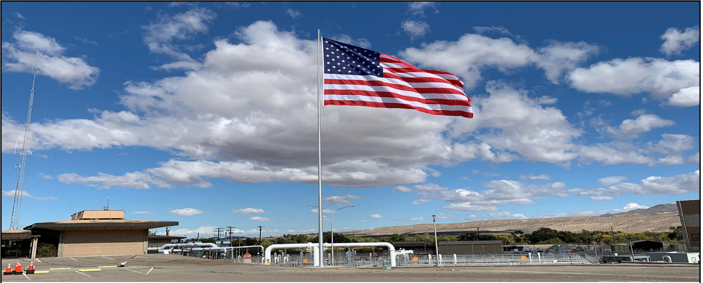
In honor of our nations military veterans, VWRA recently raised a huge American flag at our main plant in Victorville. Details on page 4