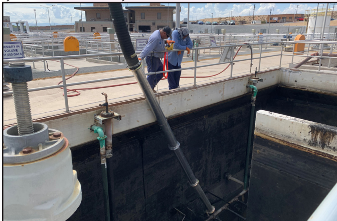
Mechanic Richard Swatzell (l) and Utility worker Chuck Trammel use a vector truck to clean out the grit basin.