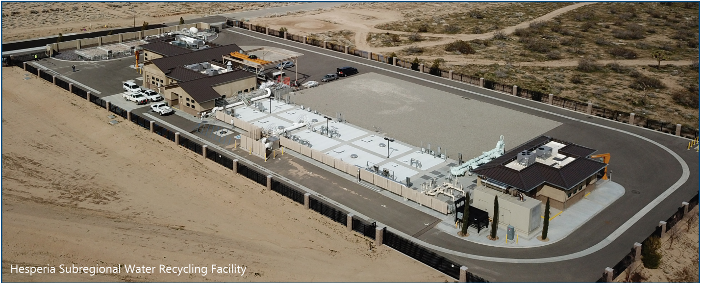
Hesperia Subregional Water Recycling Facility

Recycled water is coming to Hesperia. VWVRA has begun the start up of the Hesperia Subregional Water Recycling Facility, which involves developing a microbial population for the biological portion of the recycling process. The process can take several months to establish. The facility also uses state of the art membranes or filters to clean the water and powerful ultra violet lights for disinfection. No solids will be treated at this site. Once fully operational, the facility will provide the City of Hesperia with up one million gallons of recycled water