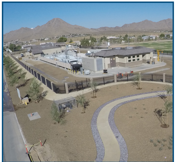
Apple Valley Water Recycling facility looking east to west.