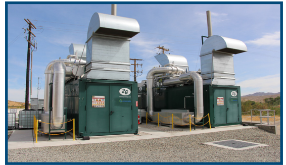
VWVRA uses two 800 kwh generators to convert biogas or methane into electricity.

In addition to generating green energy, VWVRA is a leading producer of recycled water.