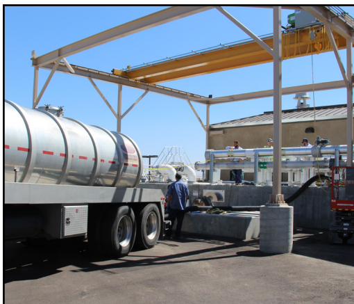
Activated sludge being delivered to the Hesperia Subregional for "seeding".

After 20 years of planning and two years of construction, the Hesperia Subregional Water Recycling Plant (WRP) began operating on September 19th. Large trucks began delivering activated sludge from VVWRA's main plant to "seed" the Hesperia plant. The water recycling at the Hesperia facility is a biological process that requires microbes to help clean the wastewater by "eating" the organic matter. The facility also features FibrePlate hybrid membrane technology, which acts as a state of the art filtering system. The startup process is expected to take several months and, for the time being, the recycled water this plant produces is just being recirculated. When fully functional, the Hesperia facility will be capable of producing up to one million gallons of recycled water per day. Once the city of Hesperia completes a water delivery pipeline, the recycled water will be able to be delivered to the Hesperia Golf Course, the Civic Center and area parks.