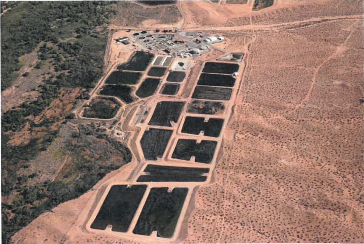
VWRA Regional Plant

Our goals, objectives and strategies are transformed into numbers for the budgets with a projection for the rest of FY 2019. The consolidated budget on the previous page shows all functions of the entire organization. The page 37 demonstrates a reconciliation of FY 2018 actual to CAFR for the year ended June 30, 2018. The budget on page 39 is for the Operations and Maintenance Fund, the pages 41 and 42 show the budget for the Repairs and Replacements Fund, and the page 43 shows the budget for the Capital Fund.